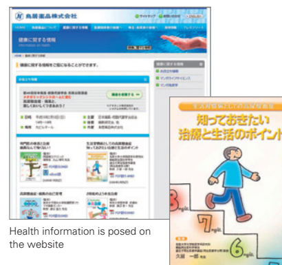
Health information is posed on the website

A variety of programs are in place to raise public awareness of the medical care. In particular, Torii Pharmaceutical Co., Ltd. disseminates health information through brochures, the Internet, and other media.