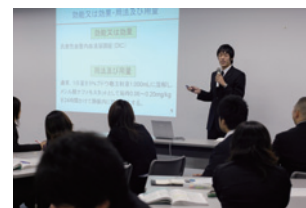
At a seminar

In FY 2007, the company held such seminars at 14 branch offices, with each branch having its own study sessions to raise awareness of MR activities and help MRs develop technical expertise.